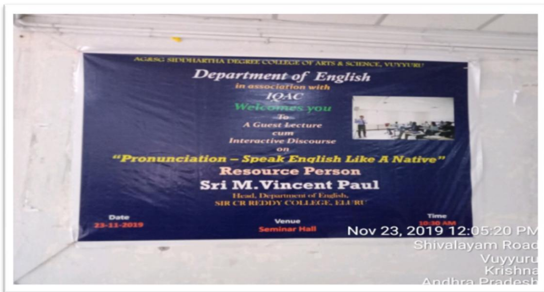
Guest lecture Banner